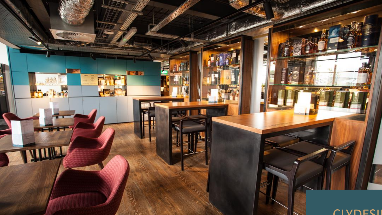
CLYDE SIDE CAFE