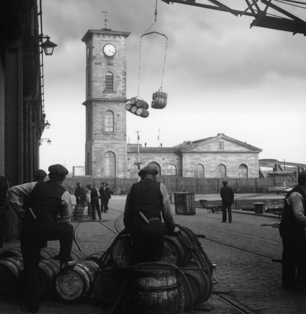
THE PUMPHOUSE AS SEEN IN 1930 AND (LEFT) IN 2017 AS THE CLYDESDIDE DISTILLERY (RIGHT).