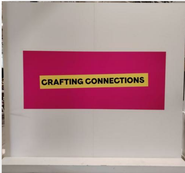
Logo only / partial coverage

Your brand and key messaging will be displayed on 2 perpendicular walls measuring 3m x 6m each, forming the backdrop for the cloakroom at the B2B Workshop.