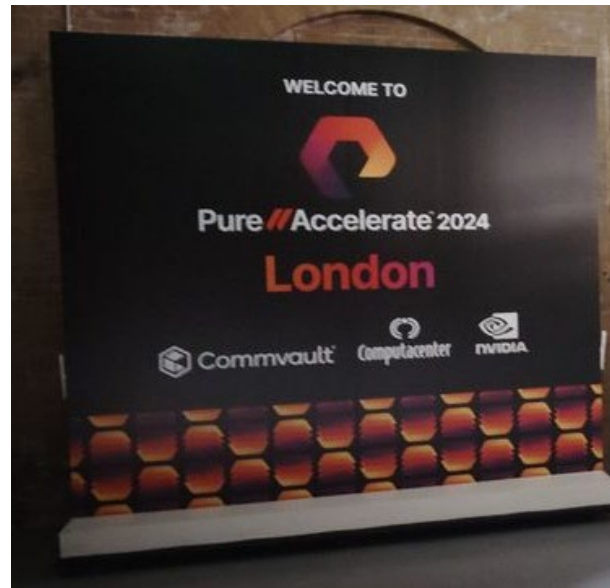
Full artwork coverage